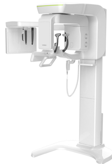
The 3D X-Ray Scanner produces a high-resolution image of your entire mouth.

your healthy and beautiful smile. Call us at 800-372-4554 or 800-354-1905 to schedule your next appointment today.